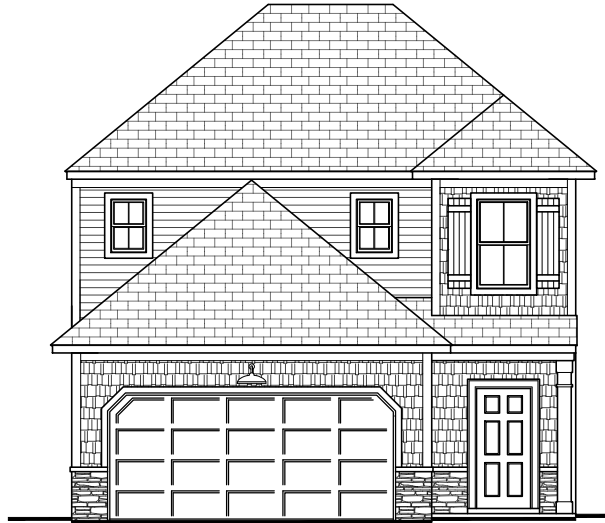
FRONT ELEVATION "C"