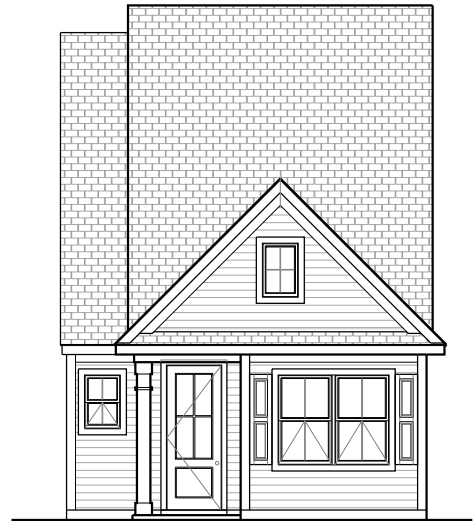
FRONT ELEVATION "A" SCALE: N.T.S

NOTE: Graphic hatching is only a design depiction of materials and or a change of materials. its does not specify or intend to specify specific materials and or finishes.