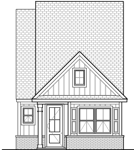
FRONT ELEVATION "B" SCALE: N.T.S