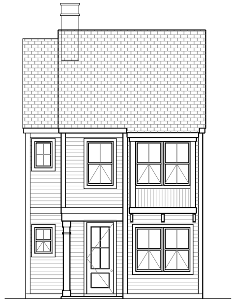
FRONT ELEVATION "A" SCALE: N.T.S

NOTE: Graphic hatching is only a design depiction of materials and or a change of materials. its does not specify or intend to specify specific materials and or finishes.