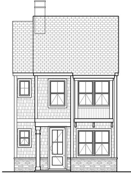
FRONT ELEVATION "C" SCALE: N.T.S