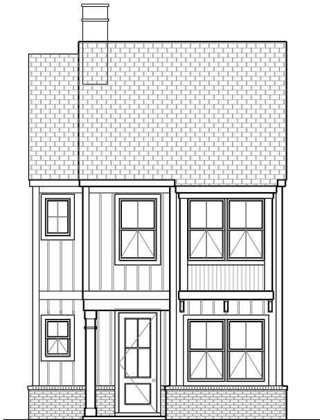
FRONT ELEVATION "B" SCALE: N.T.S