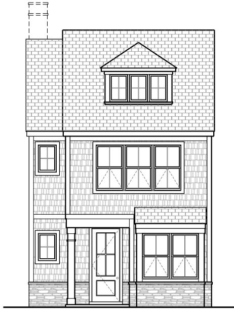
FRONT ELEVATION "C" SCALE: N.T.S