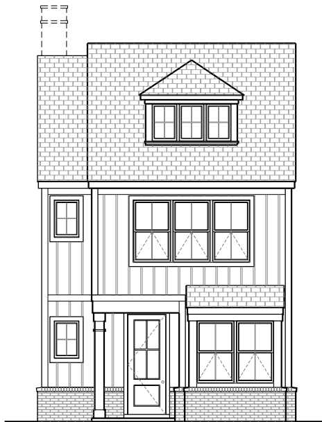
FRONT ELEVATION "B" SCALE: N.T.S