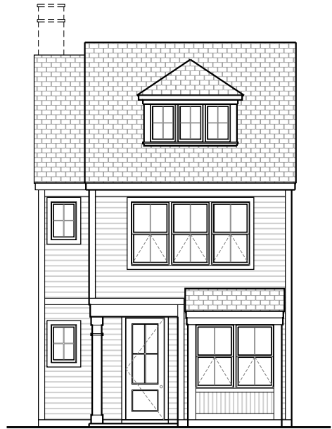
FRONT ELEVATION "A" SCALE: N.T.S

NOTE: Graphic hatching is only a design depiction of materials and or a change of materials. its does not specify or intend to specify specific materials and or finishes.